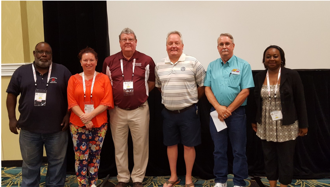
New Regional Directors were chosen at the Conference in Richmond.