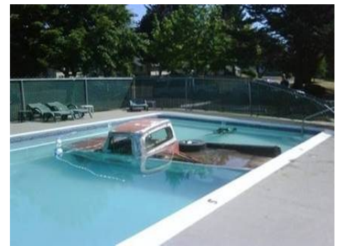
Truck being washed!