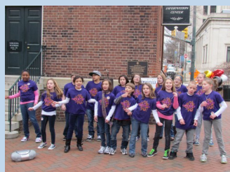
Waller Mill Elem. Fine Arts Magnet School